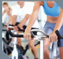
SPORTS & LEISURE